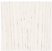
Bianco poro aperto White open pore