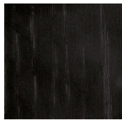
Nero poro aperto Black open pore