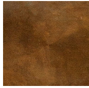
Ottone brunito a mano Hand burnished brass